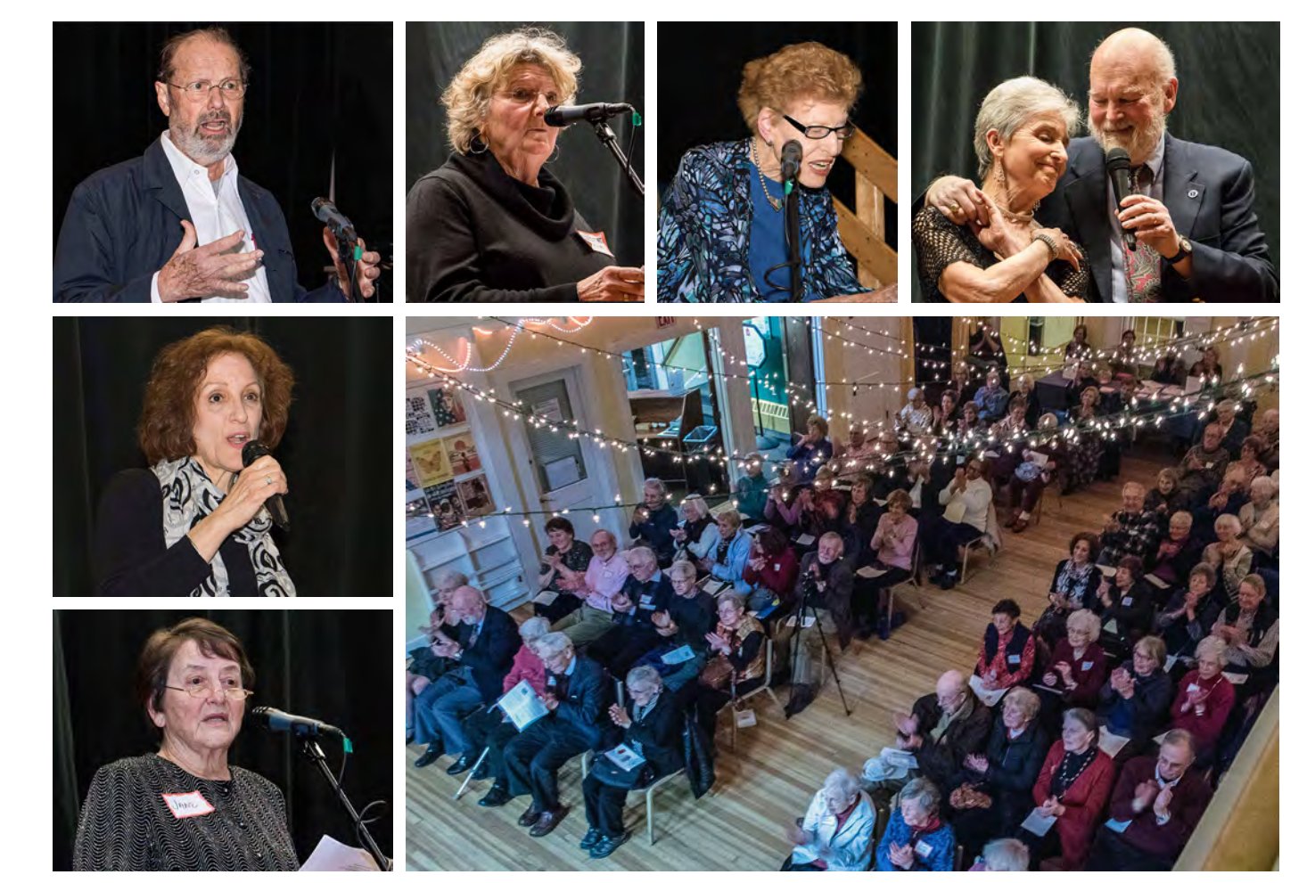
HomeHaven News April 2018